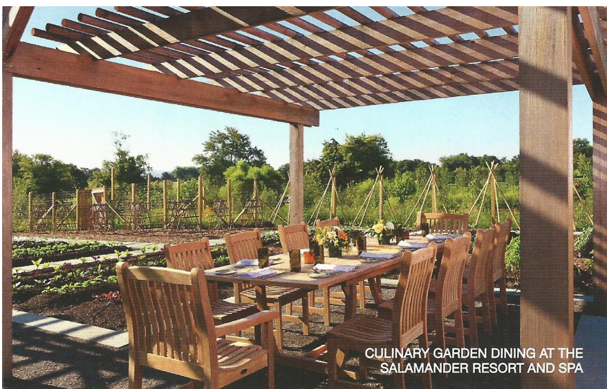
CULINARY GARDEN DINING AT THE SALAMANDER RESORT AND SPA